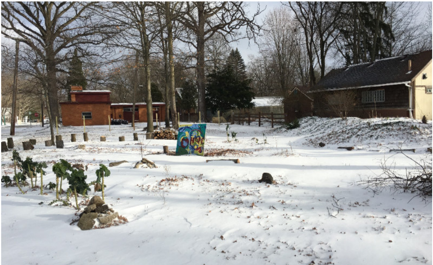
Winter Holds Steady as we prepare for Spring Activities

March is here, and Spring is right around the corner. With a new garden manager, a new website in the works, and lots of other plans for our property on Greydale St., 2016 is poised to be an exciting year for Voices for Earth Justice. Volunteer days will start soon and we look forward to hosting you at Hope House and other events around the city. Please consider donating to support our efforts to expand our vegetable garden.