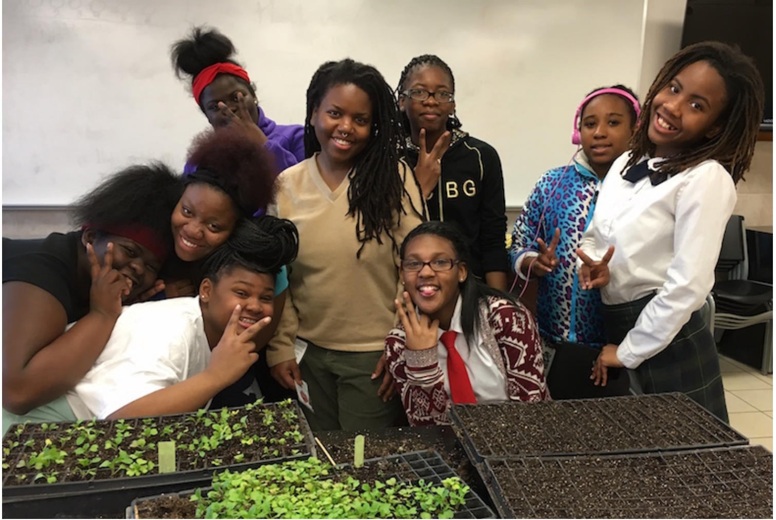
Students at Old Redford Academy pose with Bianca after a fun and educational day!